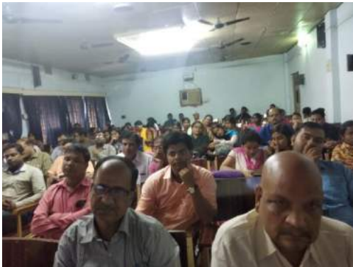
Participants of the workshop