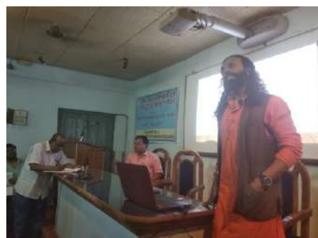
Talk being delivered by resource person