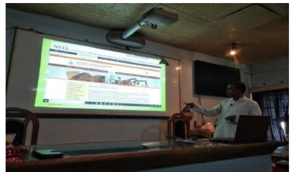
Audience of the seminar