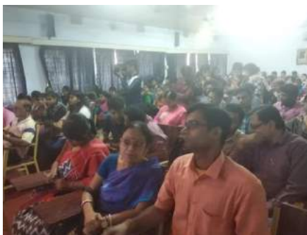
Attendees of the Seminar