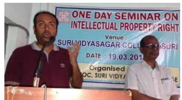
Introduction of resource person by the Coordinator, IQAC