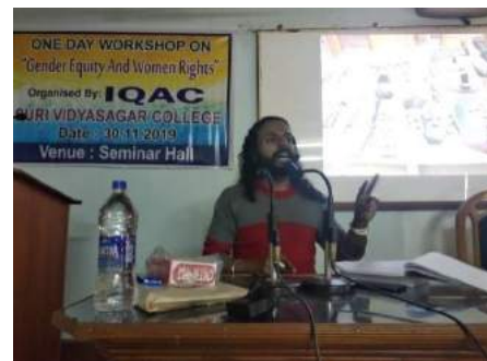
Deliberations by resource persons