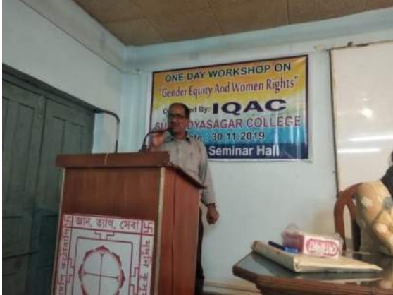
Interaction with Participants

Website : surividyasagarcollege.org.in , e-mail : surividyasagarcollege1942@gmail.com This Institution is Ragging Free