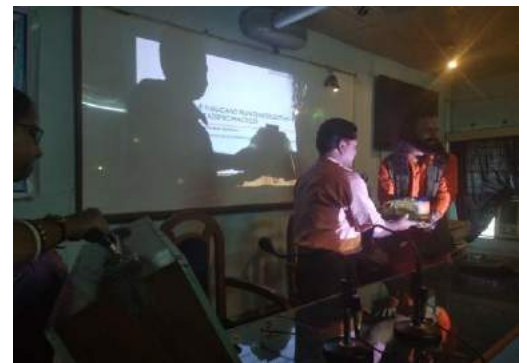
Welcoming the Resource person by Principal with souvenir and a packet of sweet