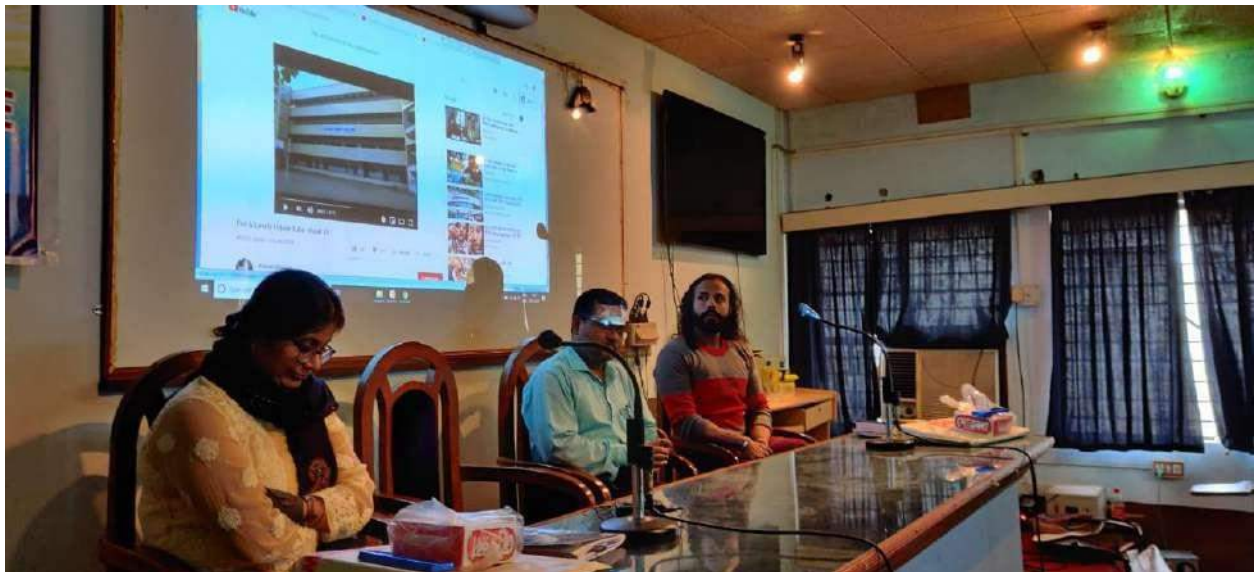
Principal with Resource Persons